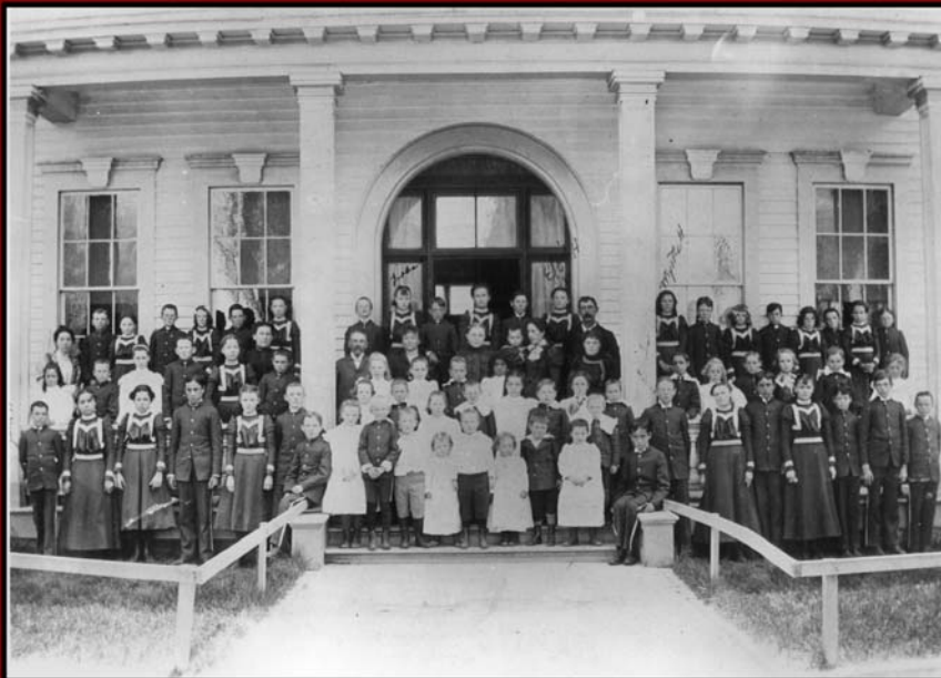
The Nevada State Orphans Home, 1896

“When we are forgotten, we cease to be.”